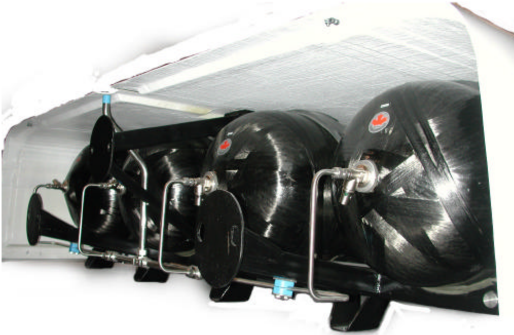
Roof Mount CNG Fuel Storage System